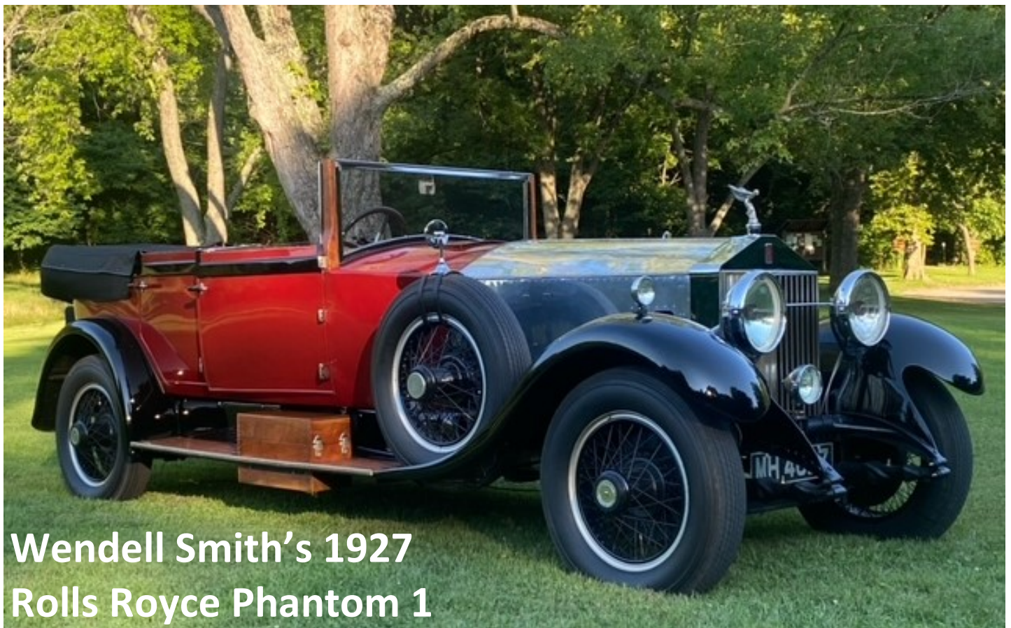
Wendell Smith's 1927 Rolls Royce Phantom 1